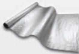
CoolMax™ M-Foil One CMF1

Three layers reflective insulation made up of single sided high reflective metalized polyester bonded to HDPE woven fabric with special bonding material.