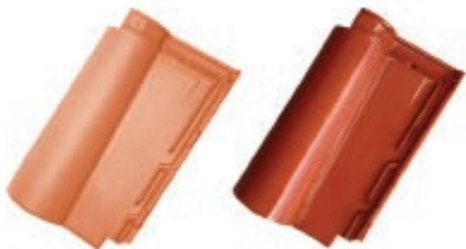
Natural Tone Malaysia (N.1M)