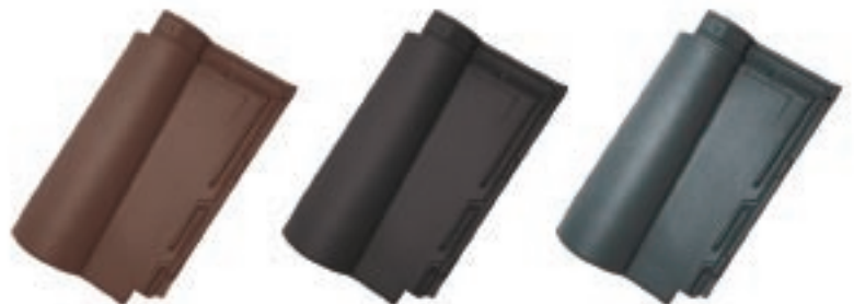
Noir Chocolate (MS.4)