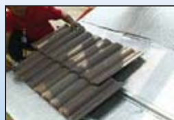
Step 6 Install roof tiles according to manufacturer's recommendations.