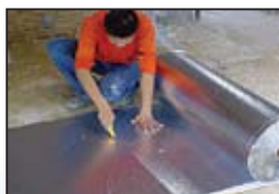
Step 1 Measure the width of the roof and by using blade cut the length accordingly.