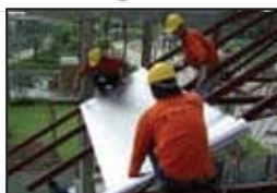
Step 2 Starting from trusses edge, lay CoolMax™ across the purlins.