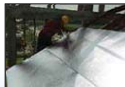
Step 3 Using self-tapping screw for light weight trusses or stapler for timber trusses to secure CoolMax™.