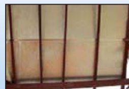
Step 7 View from roof underneath.