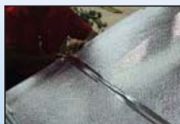
Step 4 Make sure overlapping shall be at least 50mm and stick with PP all weather tape which is heavy duty self extinguished tape.