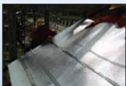
Step 5 Batten can be installed on top of CoolMax™ following the roof profile spacing.